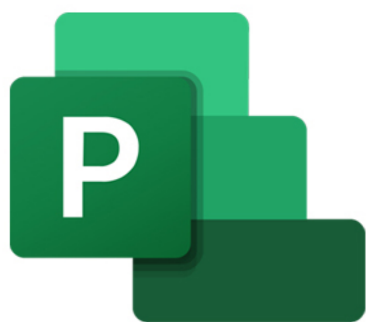
Microsoft Project for the Web